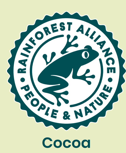
One certified ingredient

If the ingredient volume is part of a longer claim statement then it can be positioned to the side of the Rainforest Alliance seal as shown far right.