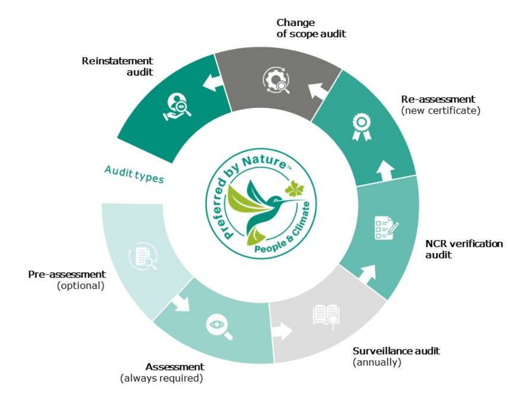
Figure 1: Illustration of audit types used in Preferred by Nature Certification.