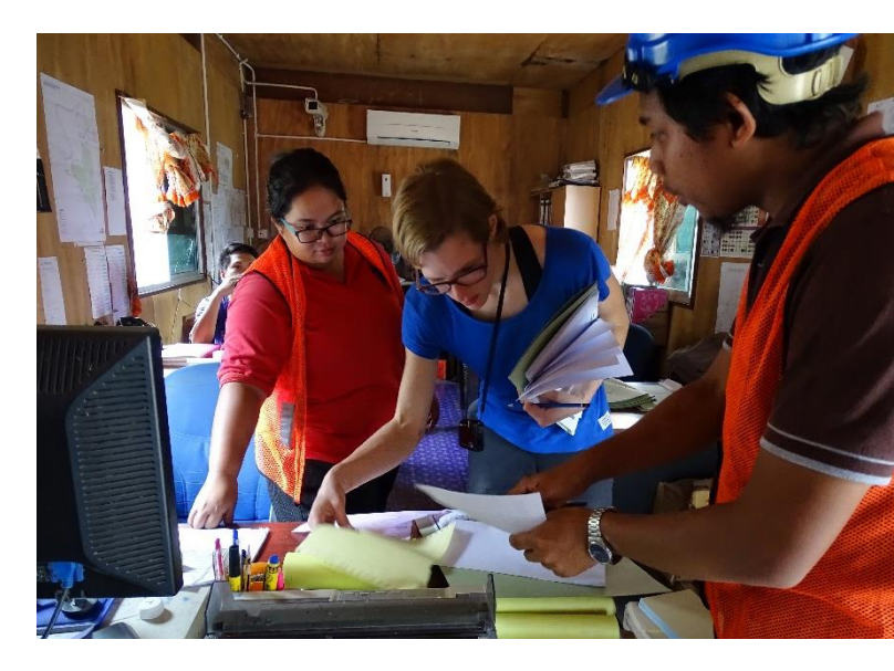
1) or 10 calendar days after the deadline of the nonaddressed nonconformity (situation 2).

After a certificate has been suspended or terminated, the company may not make any claims about conformance with the certification standard(s) and may not sell previously labelled products until certification trademarks are removed.