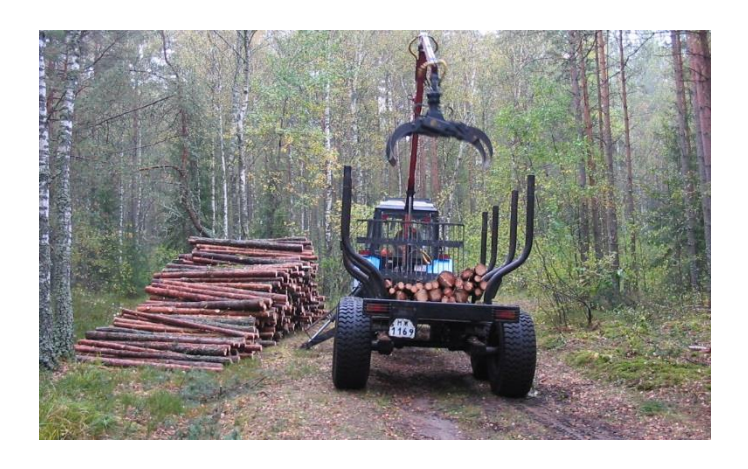
FSC™ A000535/ FSC accredited certification body

Forest contractors play a key role in securing sustainable forest management practices. At the same time, this can enhance access to certification for family forest owners. Therefore, we engage in developing and providing contractor certification.