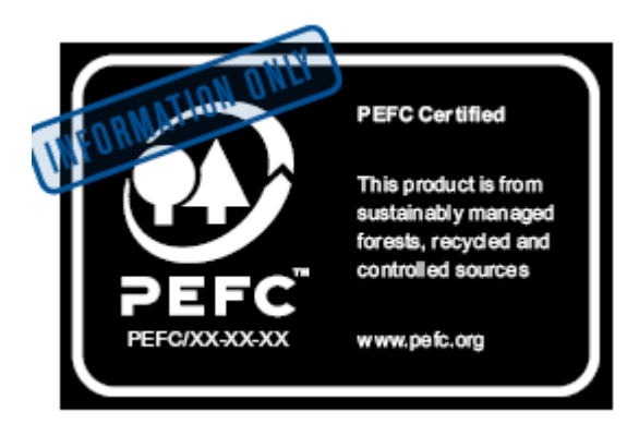
White on solid black