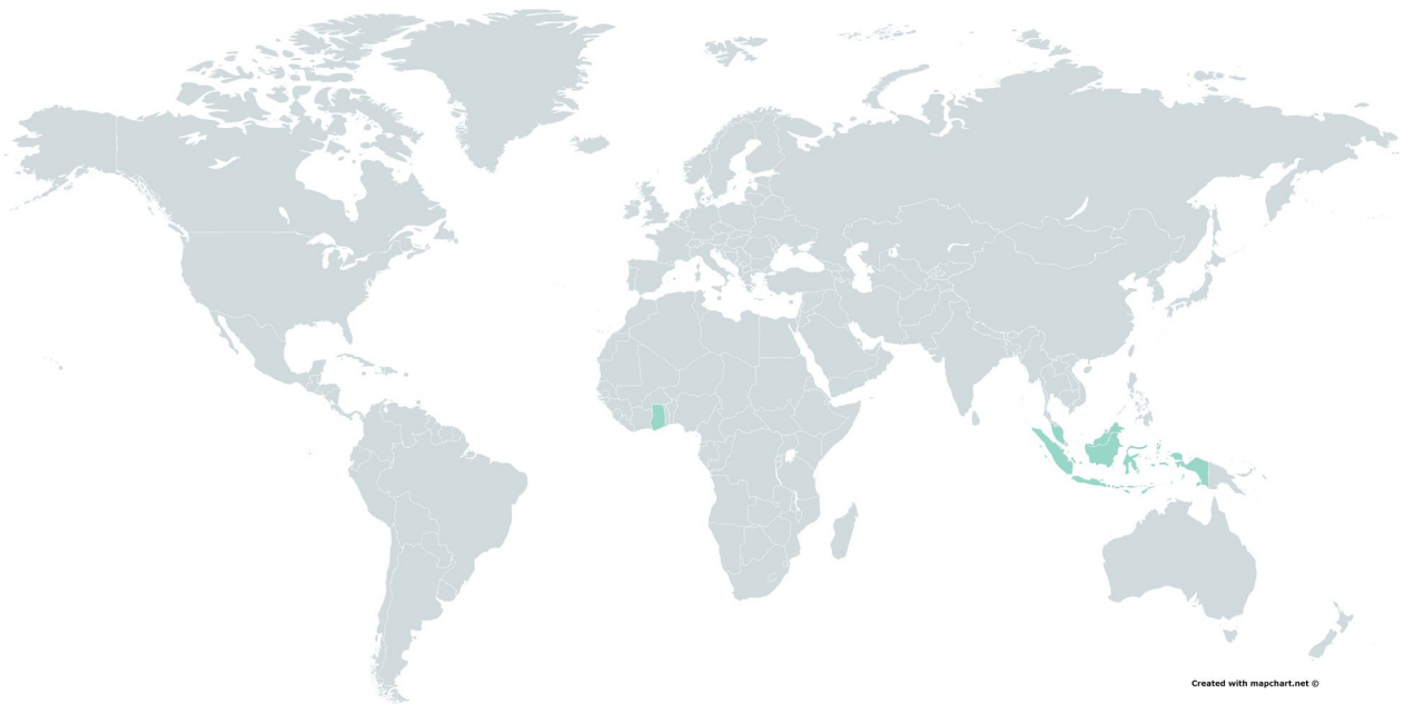
Figure 1. Countries for which NEPCon have developed a risk assessment for palm oil

Each of the CSR categories are considered minimum legal, environmental and social responsible criteria that should met for palm oil plantation establishment and management. The criteria are in line with key CSR International Guidelines Content Areas as identified, analysed and published by the Danish Business Authority: A comparison of 4 international guidelines for CSR OECD Guidelines for Multinational Enterprises, ISO 26000 Guidance on Social Responsibility, UN Global Compact and UN Guiding Principles on Business and Human Rights, January 2015. This risk assessment used the methodology detailed in the Corporate Social Responsibility (CSR) Palm Oil Risk Assessment Framework Guidelines (November 2015).